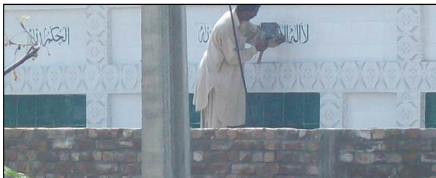
Defilement of the Kalima on police orders

Dheroke, Toba Tek Singh; October 10, 2010: The local Ahmadiyya place of worship here was reconstructed. The Islamic creed Kalima was written on its outer wall; the same tiles with the Kalima on them were placed there again.